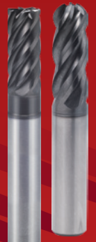
V7 PLUS A